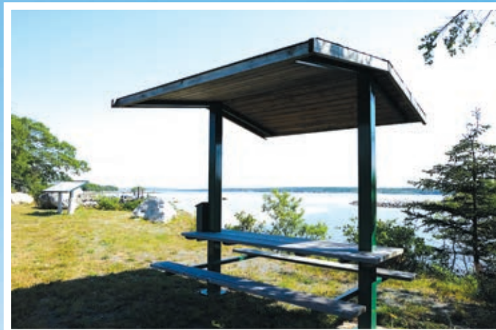
Gunning Cove Interpretive Site