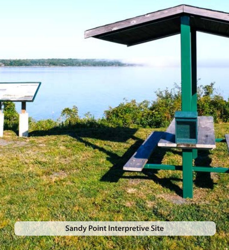
Sandy Point Interpretive Site

Jordan Youth Park is located in Jordan Falls by Exit 24 on Highway 103, near the bridge that crosses Jordan River. It is a park and playground that includes climbing bars, a slide, swings, a basketball hoop, and several picnic areas.