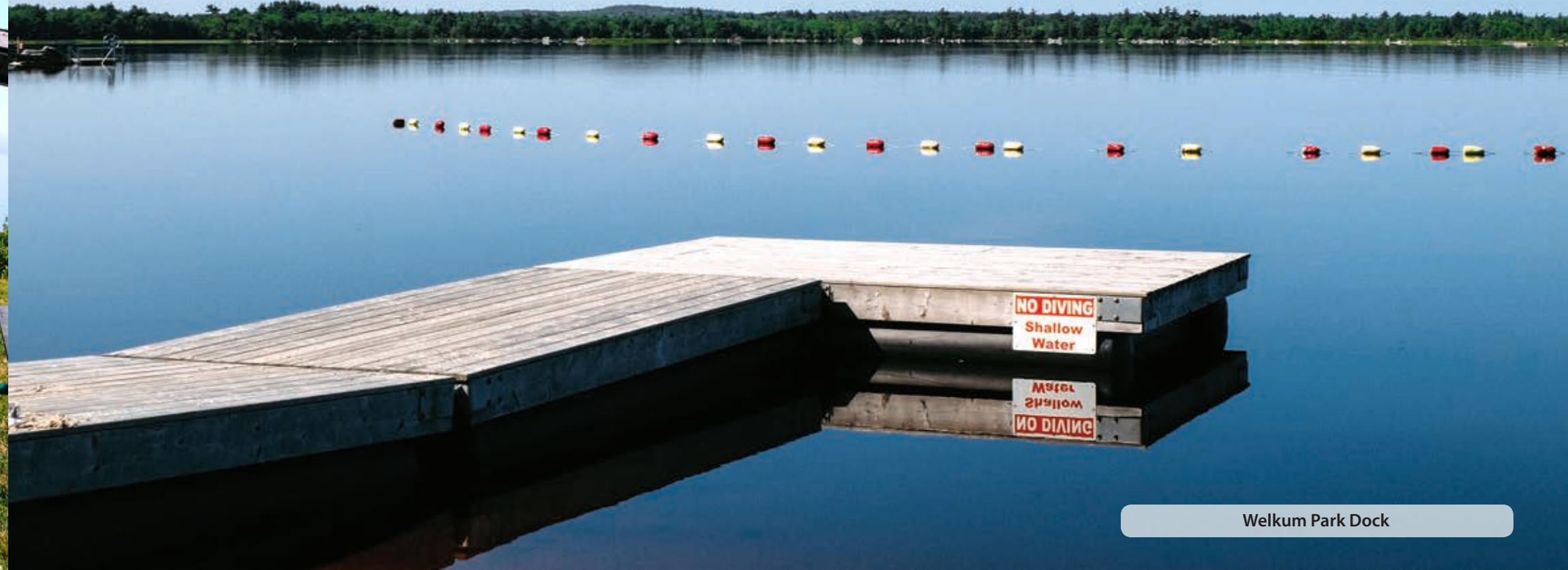
Welkum Park Dock