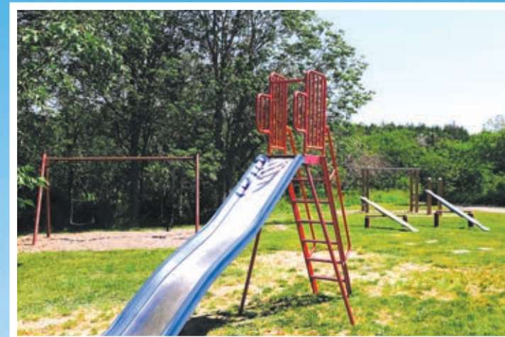
Jordan Youth Park Play Area