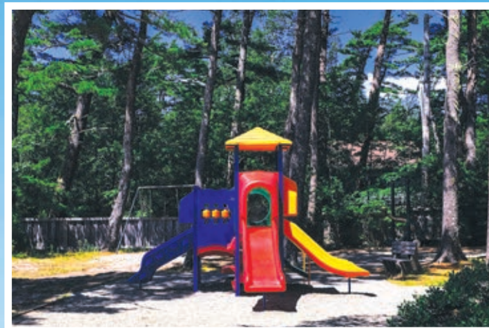
Welkum Park Playground